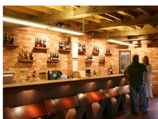
Wirra Wirra Cellar Door